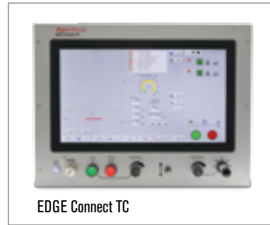
EDGE Connect TC