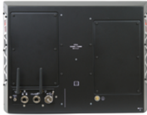
EtherCAT offers single cable connectivity.

The Hypertherm EDGE Connect will launch in early 2016. We anticipate beginning to take orders shortly thereafter.