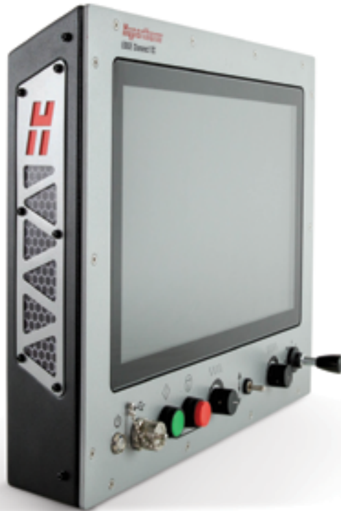
EDGE Connect TC with integrated touch screen and operators console

These are software based utilities that provide functionality without the need for additional hardware and labor for wiring and configuration. They integrate seamlessly with Phoenix and enhance what OEMs can offer within their table configurations. Each system ships with basic functionality and developer/upgrade options will be available for purchase.