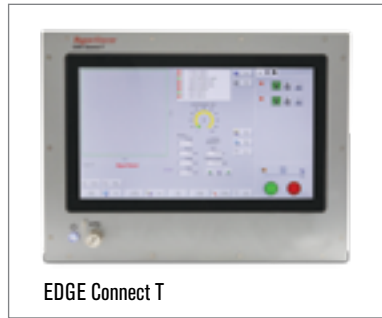
EDGE Connect T